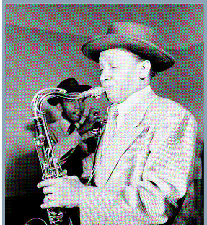
Born in Louisiana, moved to Texas at 6 months old and would later play a role in breaking down the segregation of audiences in Houston. You know the name. See complete story, page 2