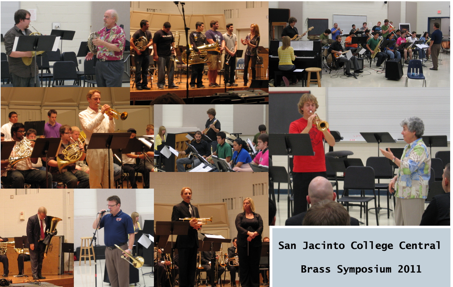
San Jacinto College Central Brass Symposium 2011

Allen Vizzutti concluded the evening by soloing with the ensemble on Episode 5 , from Five Episodes for Brass , a piece written originally by Vizzutti and Jeff Tyzik for Doc Severinsen and the Summit Brass. Again, he displayed complete command of the instrument and his expressive musical phrases. In a rare combination of talent Kirk, Bacon and Vizzutti treated the audience to masterful performances that were a fitting conclusion to a marvelous brass symposium. 🎵