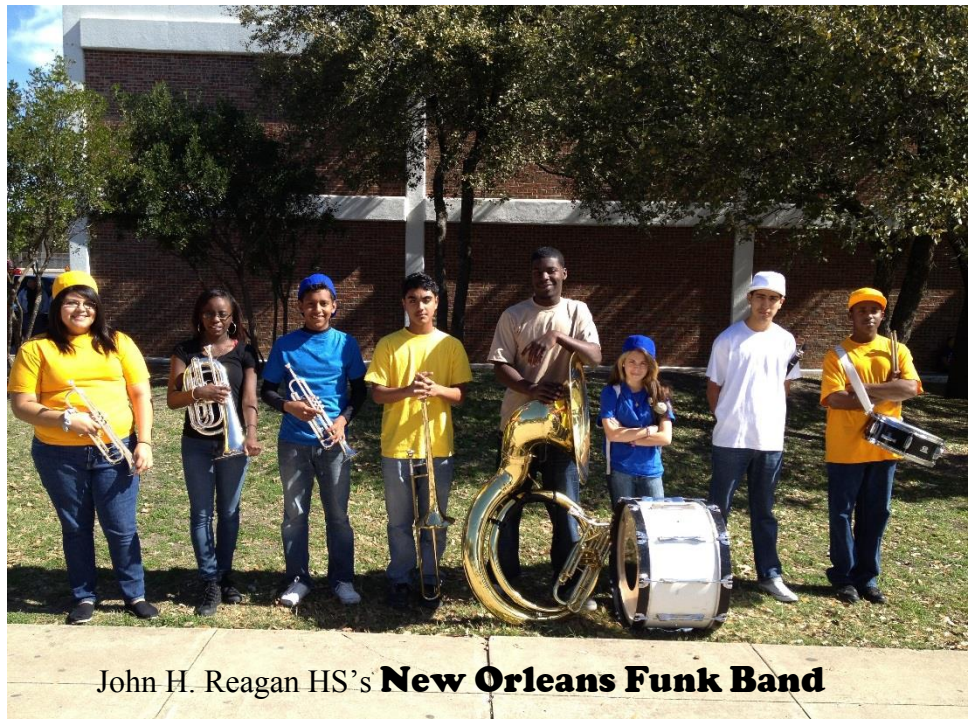
John H. Reagan HS's New Orleans Funk Band

Recently, the high school band competed in the Gorilla Music Battle of the Bands and advanced to the finals at the Red Eyed Fly in Austin. The band has become a springboard for students to become professional