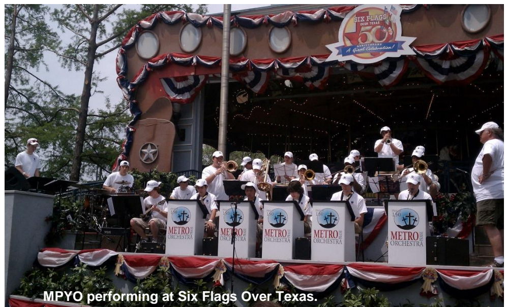
MPYO performing at Six Flags Over Texas.