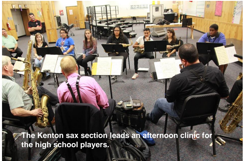
The Kenton sax section leads an afternoon clinic for the high school players.