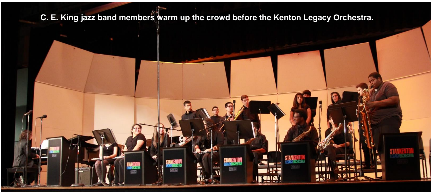
C. E. King jazz band members warm up the crowd before the Kenton Legacy Orchestra.