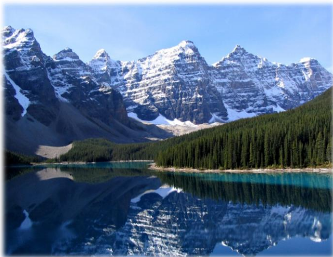
Moraine Lake, Banff National Park, Canada

While the thermometer was pushing the 80 degree mark in Houston I was thinking about walking again along the inner harbor of Victoria, BC and enjoying their 60 degree August weather. Among other things we got to visit some magnificent gardens and take a boat ride over the chilly ocean waters to see pods of whales " improvising " their water games. Would you enjoy a similar experience and perhaps enjoy treating your ears to some marvelous jazz at the same time?