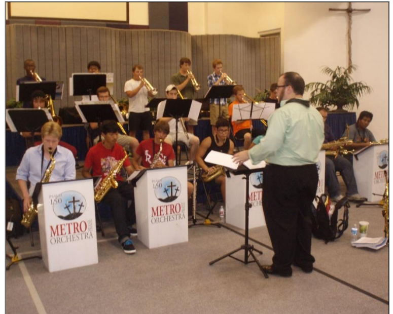
Summer session begins in June for the Metro Praise Youth Orchestra. See p. 2.