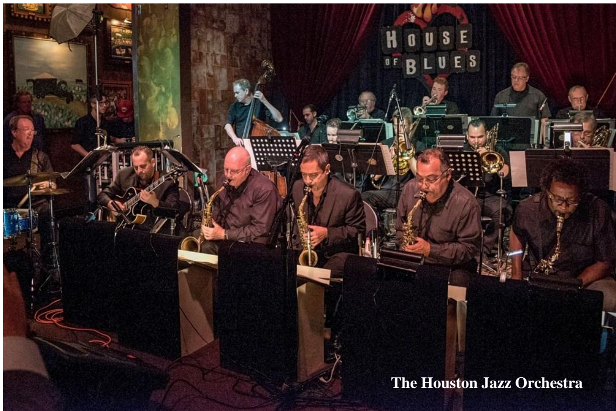
The Houston Jazz Orchestra

Special guest artists for the festival will be the Houston Jazz Orchestra , featuring many of Houston’s most legendary players. Members of the HJO will also serve as clinicians and adjudicators for the event.